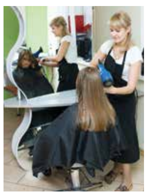
Apparel Stores / Salons