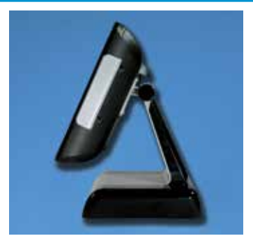
Sleek Cabinet Design