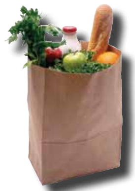
Convenience Stores / Small Grocery Stores