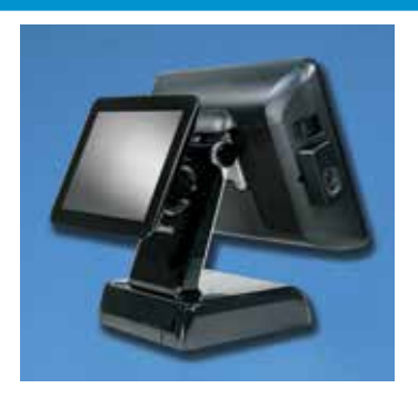
Optional Integrated 9.7" Rear LCD Customer Display