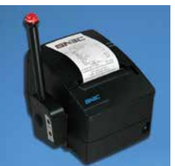
Optional Audio/Visual Print Messenger