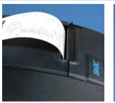
Liquid Guard Built Into the Cabinet Design