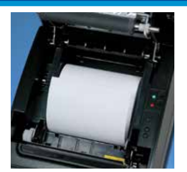
Drop and Print Paper Loading