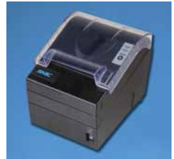
Optional Spill Cover