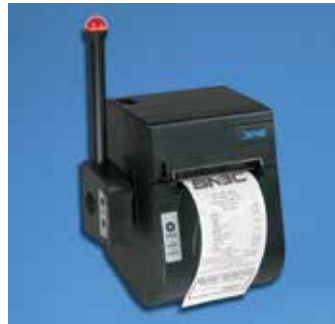
Built-In Wall Mount Capability and Optional Audio/Visual Print Messenger